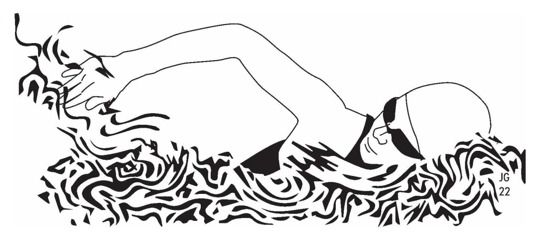
Obviously, this isn't me swimming nude, but it's my favorite drawing of how swimming FEELS.

We had perfect weather for our vacation on Rock Island in the summer of 1994. It didn't rain and the temperatures stayed warm, in the 70s and 80s, all week. The moon was full and we enjoyed spectacular moon rises most evenings. Each night, the moon rose in the midst of a grand sunset that painted the