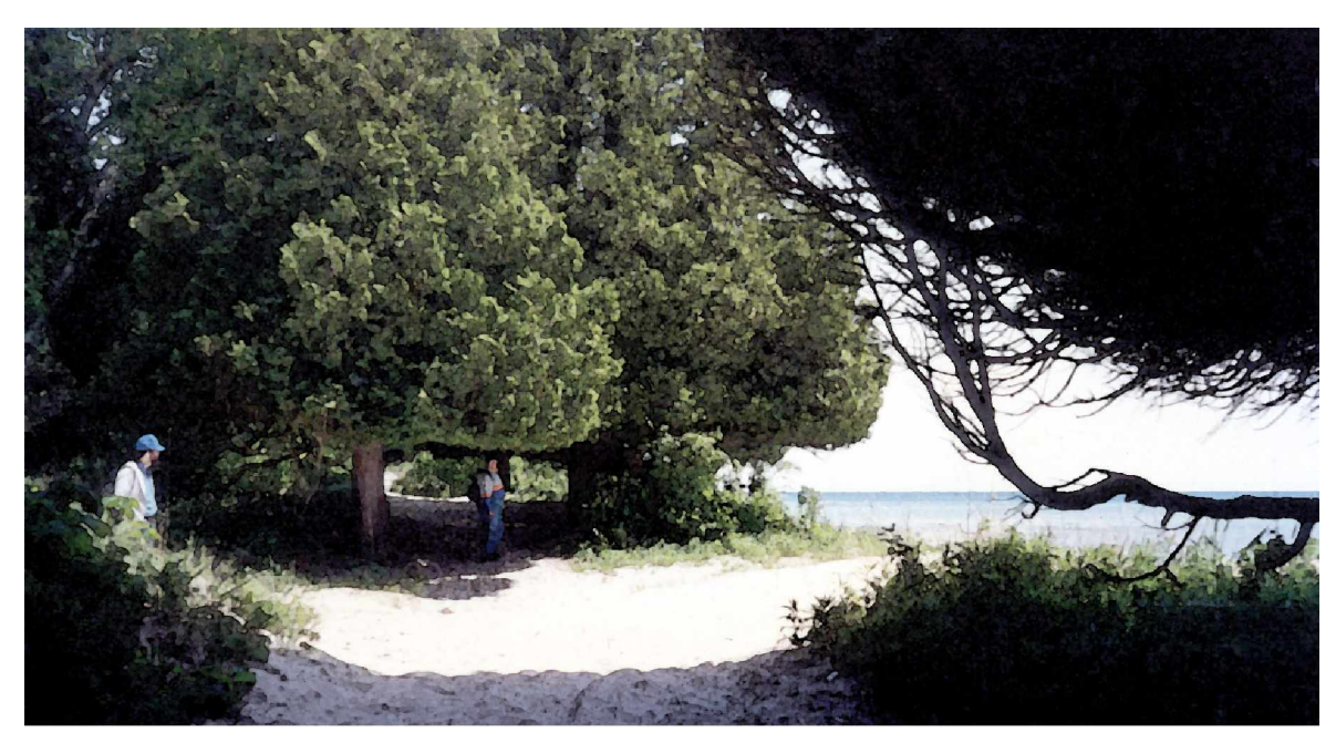
Scott and Jeanne looking toward Rock Island beach

Sometimes thunderstorms forced us out of our tent. but there were several places to shelter on the island. One of the cool things about Rock Island was inventor and millionaire Chester Thordarson's magnificent boat house, built from the island's limestone rock in 1926. The boathouse was large enough to accommodate two fifty-foot yachts. The Viking Hall occupied the floor above, a massive space reminiscent of Norse myths with rows of soaring windows, a gigantic fireplace big enough to roast a whole ox (we were told), and Icelandic oak furnishings. A white oak chandelier, nine feet high and six feet wide and adorned with twenty buffalo horns, hung from the thirty-five-foot-high beamed ceiling. It felt safe and fun to watch the storms from inside this massive structure. A lighthouse and several smaller structures also remained from the days when Thordarson owned Rock Island. The Park Ranger lived in one of them.