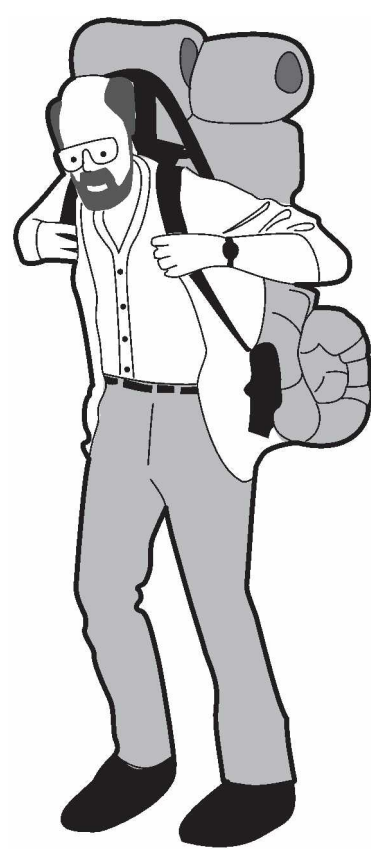
Scott, backpacking at Rock Island

Over the years, I learned some valuable lessons about camping which one fails to learn if one pulls a car into one's campsite and uses the trunk as a pantry (which